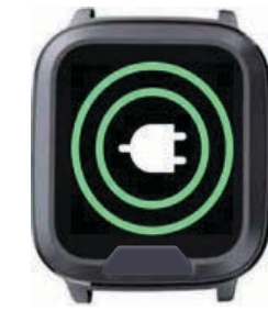
On charging base - charged