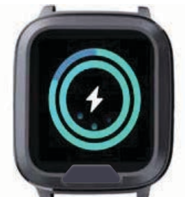
On charging base - charging