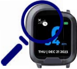
No signal, power save mode

The Smartwatch uses a standard cellular signal icon to show when coverage is strong or unavailable.