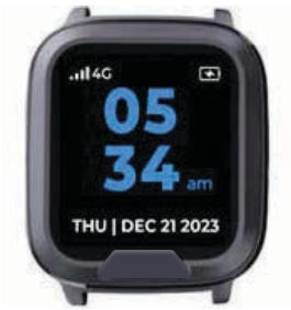
Home screen - on charging base - charging

Lifeline recommends that the Smartwatch is charged on a daily basis.