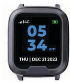
Home screen - on charging base - charged