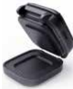
Placing watch on charging base